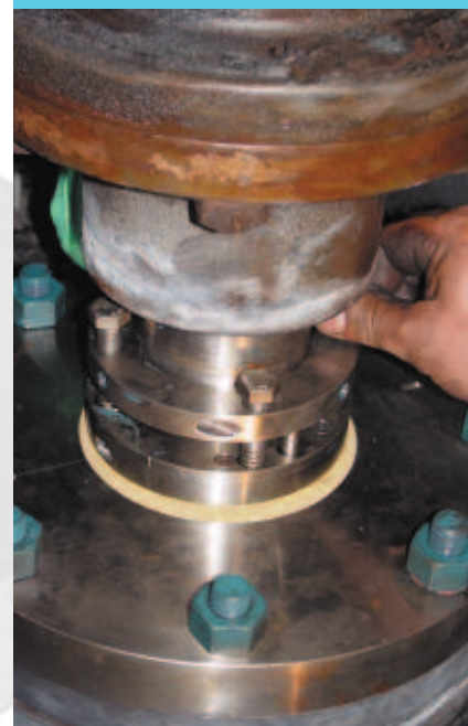
Split OFS seal on 3" top-entry agitator