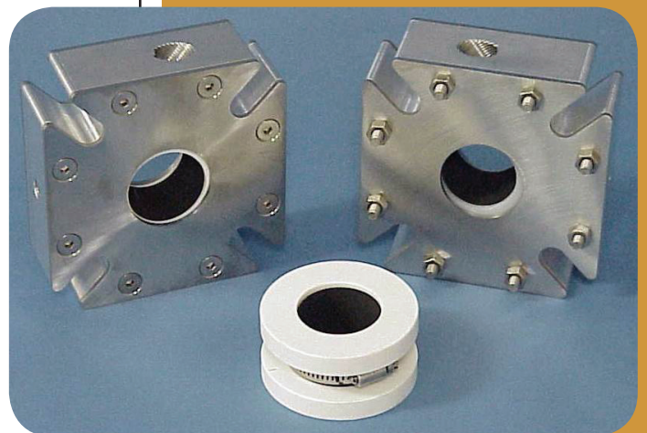
Unsplit MDU seals with aluminum housings