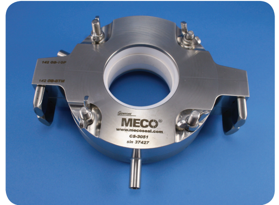
MECO Dairy Seal

A variant of MECO's popular AH model seal, the Dairy Seal is specially designed to meet the needs of dairy