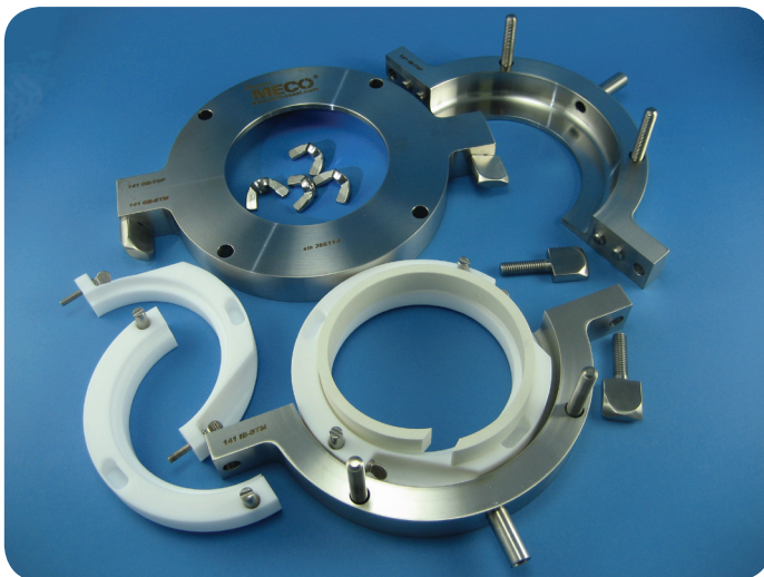
Disassembled cottage cheese mixer seal

The MECO Dairy Seal is fully-split for easy removal and bench sanitizing. The split halves of the seal parts are entirely assembled with hand-operated fasteners, eliminating the need for any tools. Each half of the split housings is serial numbered for easy identification on reassembly.